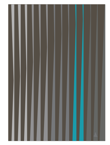
1. W773 FOSSIL